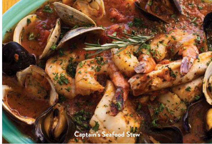
Captain's Seafood Stew