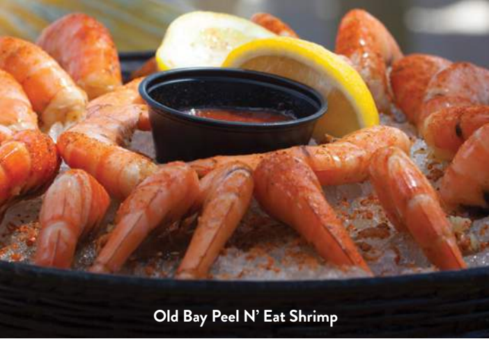
Old Bay Peel N' Eat Shrimp