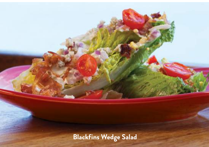
Blackfins Wedge Salad