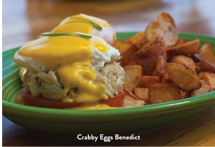
Crabby Eggs Benedict