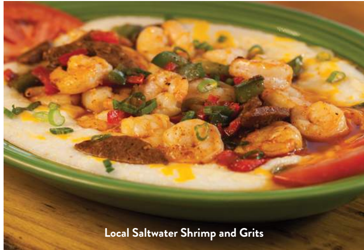
Local Saltwater Shrimp and Grits